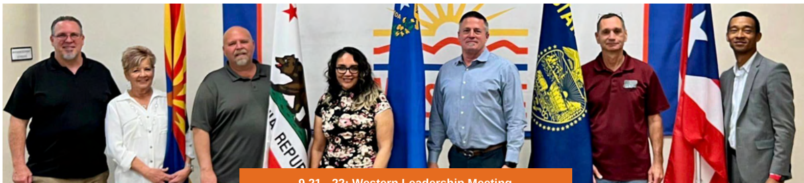
9.21 - 22: Western Leadership Meeting

In September, members of California leadership were proud to visit our WestCare Foundation office in Henderson, NV and be a part of two days of presentations, meetings, and site tours! Our state was joined by representatives on behalf of WestCare Arizona, Iowa, Nevada, Oregon, and Texas! Our motto of Uplifting the Human Spirit truly gains a whole new meaning when you learn about the scope of our organization's reach first-hand!