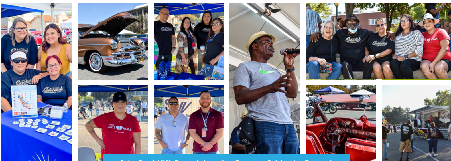
SoberStock XVII: Fresno's Longtime Recovery Celebration Returns!

In September, members of California leadership were proud to visit our WestCare Foundation office in Henderson, NV and be a part of two days of presentations, meetings, and site tours! Our state was joined by representatives on behalf of WestCare Arizona, Iowa, Nevada, Oregon, and Texas! Our motto of Uplifting the Human Spirit truly gains a whole new meaning when you learn about the scope of our organization's reach first-hand!