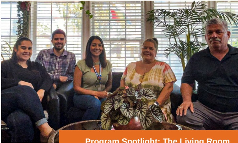
Program Spotlight: The Living Room